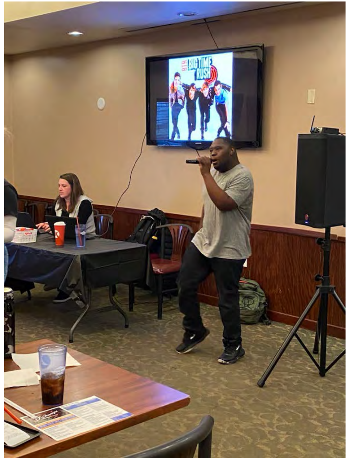
“ Karaoke “